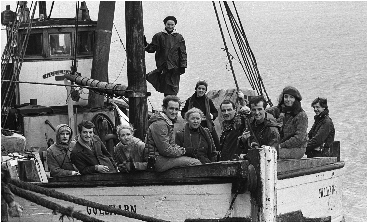
First Druid trip to the Aran Islands – 1982